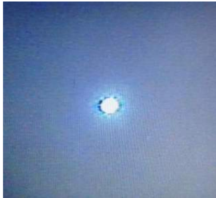
H8 series Round Shape at 3m