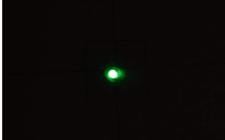
S8 series Round Shape at 10m