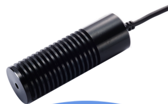
HB3532 Laser Module