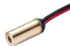
S43635 Laser Module

The Compact range of elliptical beam laser diode modules has been designed as a complete laser diode system for OEM use.