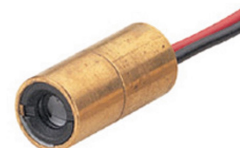
S83635 Laser Module

The compact design has made S83635/H83635 series elliptical beam laser diode modules suitable for general purpose OEM application.