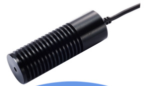
SB3532 Laser Module