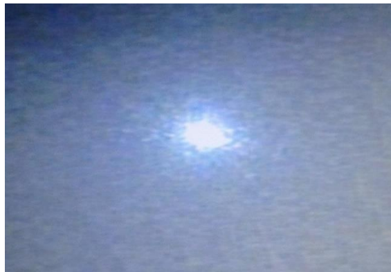
H8 Series Dot Shape at 10m